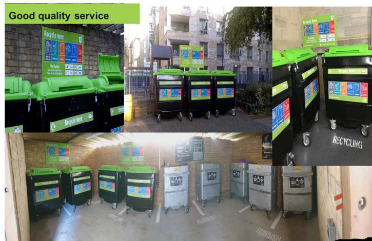
Minimum Standard Service – all estates