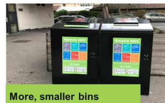
More, smaller bins