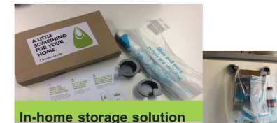
In-home storage solution