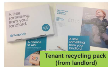
Tenant recycling pack (from landlord)